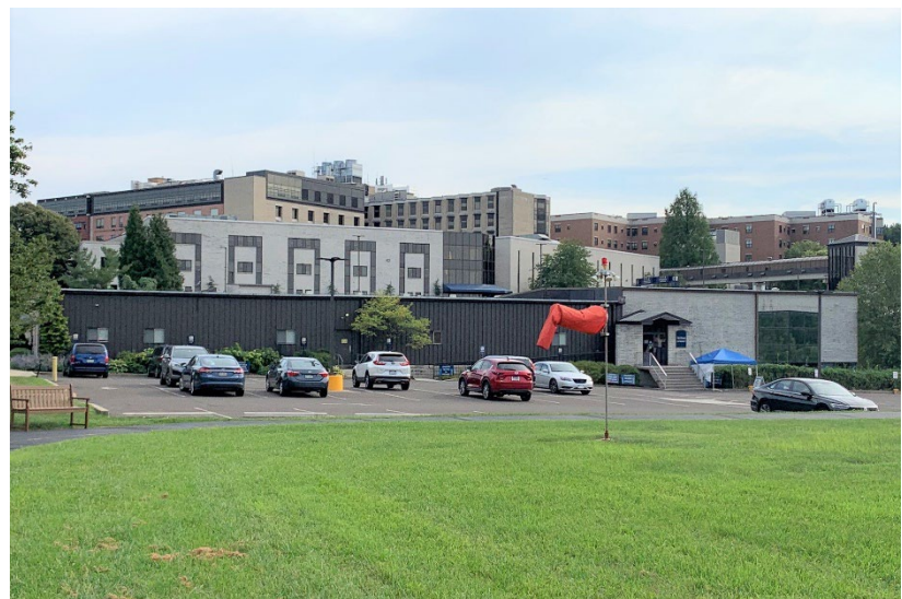
Holy Redeemer Hospital

Holy Redeemer Hospital, operated by the Sisters of the Holy Redeemer, is located on Huntingdon Pike in Meadowbrook. Founded in 1959 by the Sisters of the Holy Redeemer, the hospital now has 242-beds and a staff of more than 500 physicians. The hospital features acute, ambulatory, and emergency care; an on-site comprehensive cancer center; an on-site cardiovascular center; a full-service maternity unit with a state-of-the-art level III neonatal