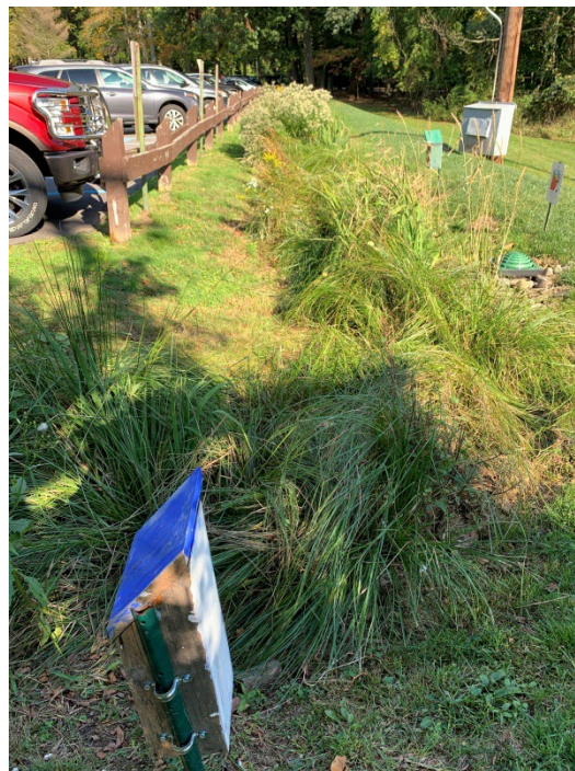
Stormwater Best Management Practice, Alverthorpe Park