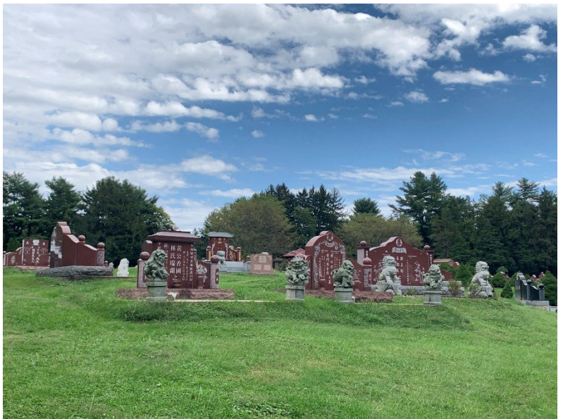
Hillside Cemetery, Roslyn/Ardsley