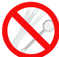
Single-Use Plastic Splash Sticks & Stirrers