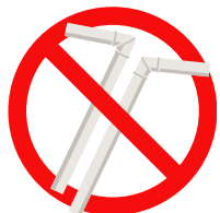
Single-Use Plastic Straws (unless requested)