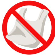
Single-Use Plastic Bags