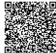
Scan the QR Code