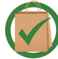
Paper Bags made from at least 40% post-consumer recycled content