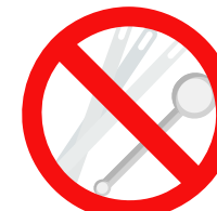
Single-Use Plastic Splash Sticks & Stirrers