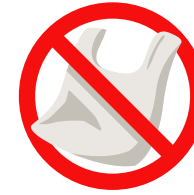
Single-Use Plastic Bags