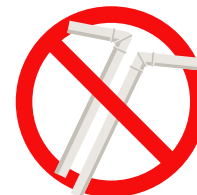
Single-Use Plastic Straws (unless requested)